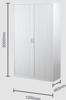
FIVE SHELF LEVELS