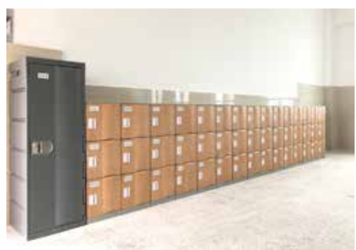
1330H x 450W